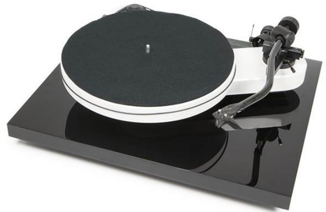
Example of use: Pro-Ject RPM3 carbon

Ground it E is a stable and height-adjustable platform for turntables, that will reduce negative effects of potential surface vibrations significantly. The use of Ground it E is very simple: Do not place your turntable directly on surfaces such as furniture or shelves that may be vibration sensitive, but place it on Ground it equipment bases. All Ground it bases will improve the sonic performance, so a pleasant, natural reproduction of vinyl music will be possible. The playback quality of a turntable placed on Ground it E will benefit because of improved dynamics and coherent timing. The ambient acoustic of the recording venue will sound much clearer and contoured, so music playback appears to be more realistic, authentic and expressive.